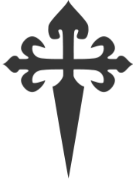
The Cross of Saint James, the symbol of the Order of Santiago; the hilt is surmounted with a scallop.

The Acts of the Apostles records that "Herod the king" (traditionally identified with Herod Agrippa) had James